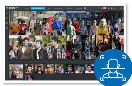
AI Powered Facial Recognition