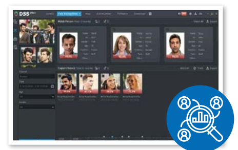
Intelligent Footage Searching