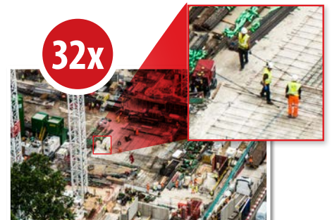
Up to 32x Lossless Optical Zoom