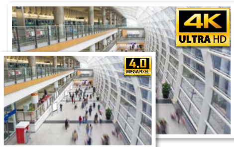
Up to 4K Ultra HD Resolution